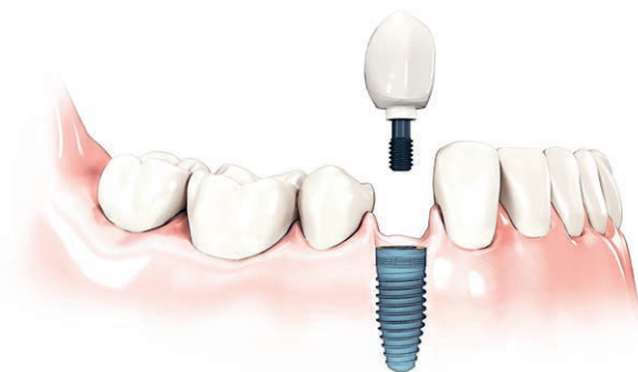
New tooth on dental implant – neighboring natural teeth are left untouched

A dental implant is inserted into your jawbone and acts just like the root of a natural tooth. With this procedure, healthy adjacent teeth are left untouched.