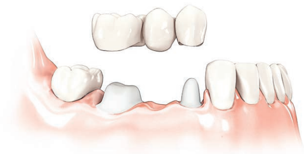
New tooth on natural teeth – neighboring natural teeth are ground down and used to support a bridge, replacing the top of the missing tooth

To avoid these disadvantages, your dentist may also be able to replace the tooth root as well, using a dental implant.